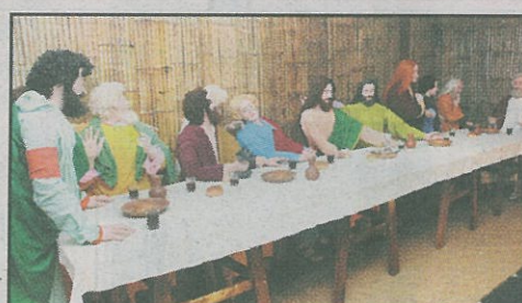
The blueprints of the proposed museum prepared by architect Shashank Mahendale. Right: A replica of the Last Supper at a wax museum in Goa